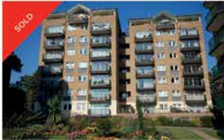
KEVERSTONE COURT PENTHOUSE

ONE OF THE OLDEST ESTABLISHED ESTATE AGENTS SPECIALISING IN EAST CLIFF HOUSE AND APARTMENT SALES WITH OVER 35 YEARS OF EXPERIENCE