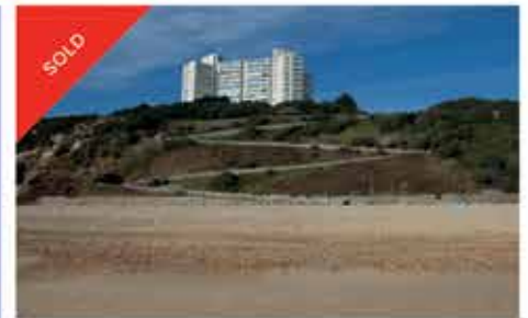
ALBANY SEVEN APARTMENTS