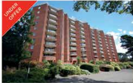
GREEN PARK THREE APARTMENTS