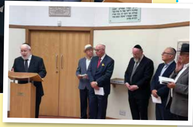
Consecration of Throop new phase