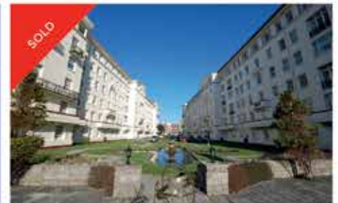
BATH HILL COURT THREE APARTMENTS

Stephen Noble Estate Agents have had unprecedented success on the East Cliff of Bournemouth recently and more instructions are urgently required following strong demand and the extension to the Stamp Duty exemption.